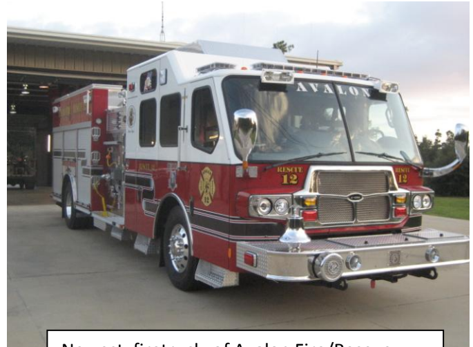
Newest firetruck of Avalon Fire/Rescue. 2009 E-One Fire/Rescue Pumper. 1000 gallons of water and 35 gallons of foam. Latest extrication equipment. Crew of 5.

I have been fortunate to serve as a Commissioner since 1990 and as Commission Chairperson since 2000. We have a great bunch of Commissioners who meet on the first and third Monday of every month at 7:00 PM to address the business of fire and rescue for our community. Join us if you have any questions.